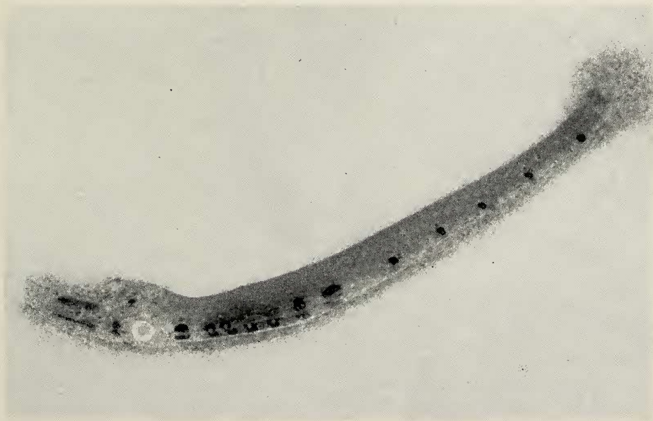
FIG. 2. Araiophos gracilis , holotype, ventral view.

Measurements of holotype expressed in per cent of the standard length (34 mm.), followed in parentheses by similar measurements of 2 specimens 31.5 mm. from tip of snout to caudal base and 30.5 mm. in standard length: depth 13.2 (12.7, 13.1-14.7); head ca. 22.1 (—, 22.9); snout 5.87 (—, 6.55); orbit 8.8